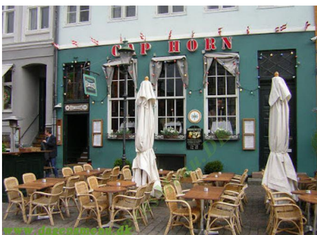
Restaurant Cap Horn, Nyhavn 21, 1051 København K Tuesday 19:30 h