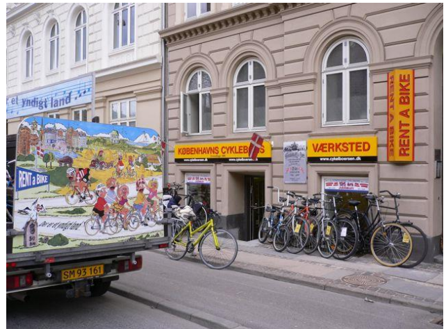
Københavns Cyklebørs, Gothersgade 157, 1123 København Tuesday 8:30 h, Wednesday 8:30 h and 17:30 h