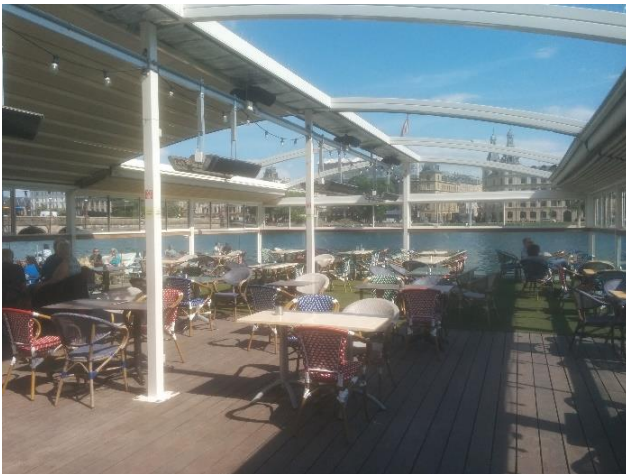
Kaffesalonen Pier, Peblinge Dossering 7, 2200 København N Monday 19:30-21 h