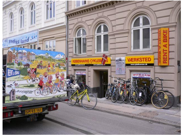
Københavns Cyklebørs, Gothersgade 157, 1123 København Monday 8:30 h, Tuesday 8:30 h and 16:00 h