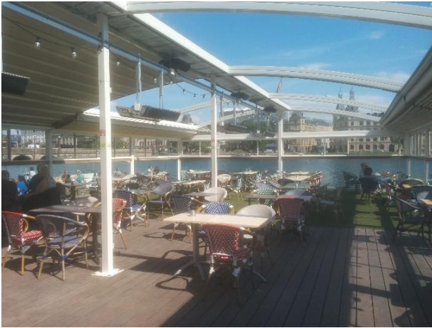
Kaffesalonen Pier, Peblinge Dossering 7, 2200 København N Sunday 19:30-21 h